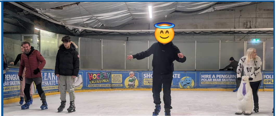
Atlantic Class trip to Gosport Ice Skating Rink